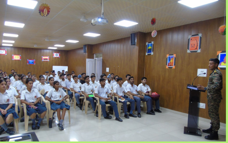
ARMY REACHES OUT TO SCHOOL STUDENTS THROUGH 'KNOW YOUR ARMY' A COUNSELLING SESSION WITH AN AIM TO EMPOWER, ENCOURAGE AND ENGAGE THE STUDENTS IN A CONSTRUCTIVE WAY.