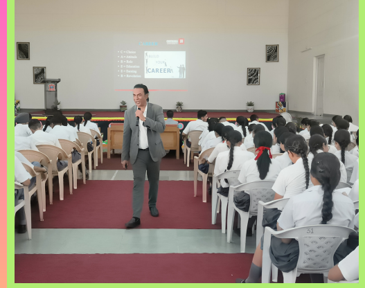
GUIDANCE BY CHITKARA UNIVERSITY WITH AN AIM TO GUIDE THE STUDENTS OF XI & XII FOR THE PREPARATION OF NEET & JEE .